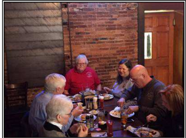
Lunch at Bullwinkle's