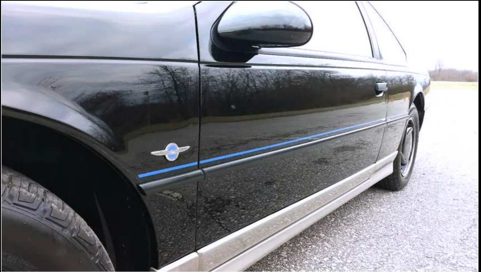
The Blue Side Stripe and Special Badging