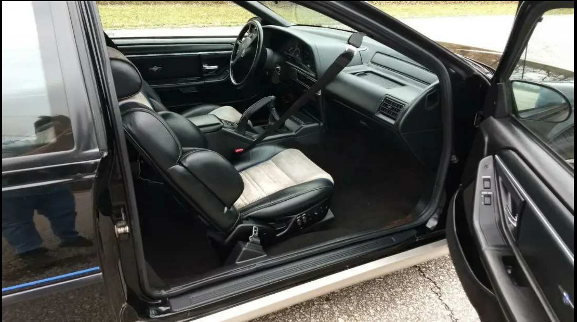
Unique Two-Tone Black and White Upholstery Note the Side Bolsters