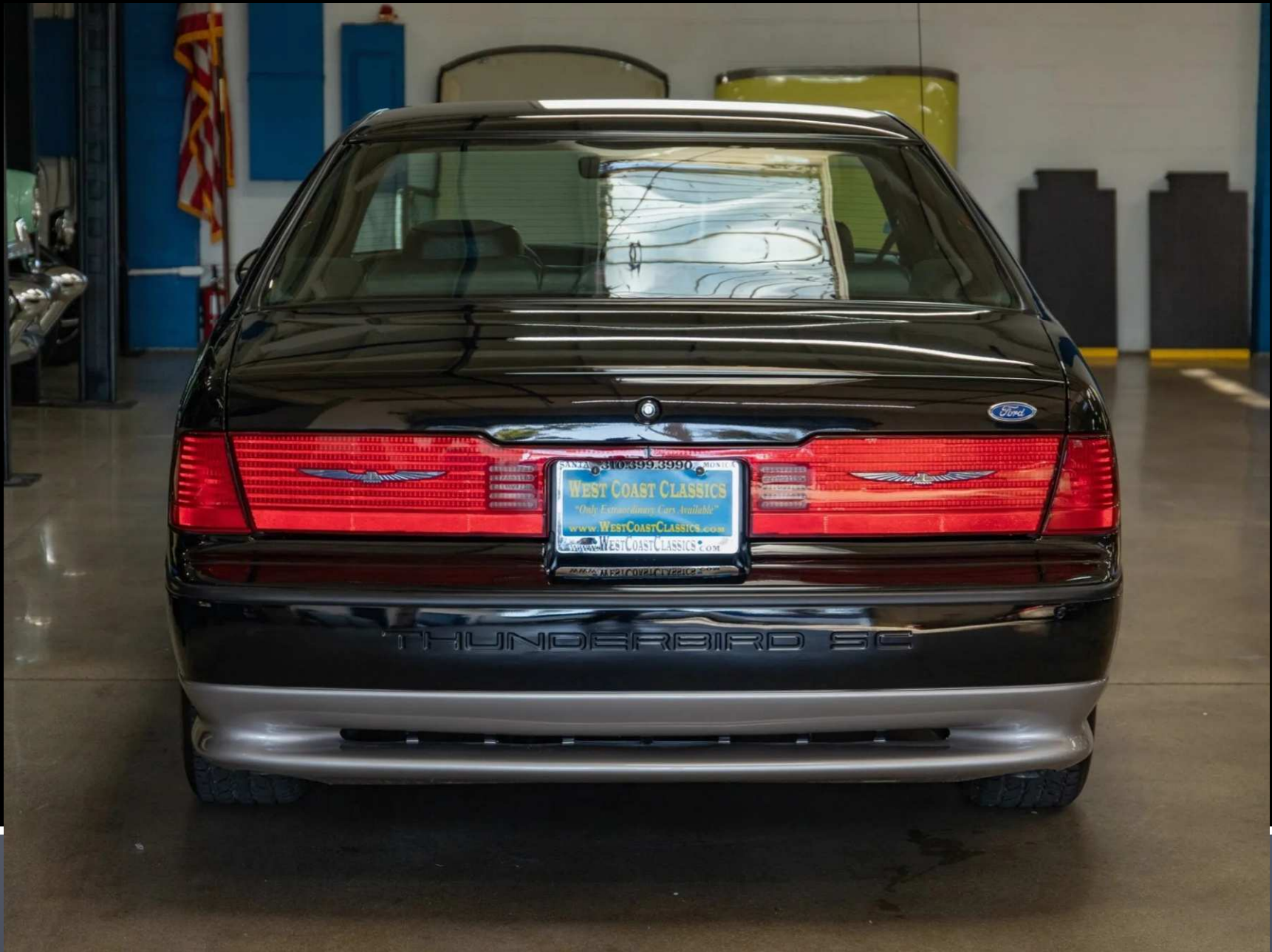
From the Back