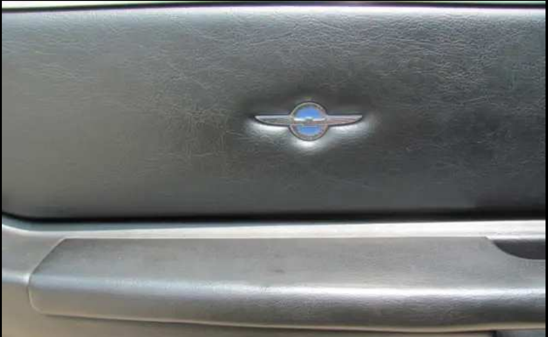
Special Door Panel Badges