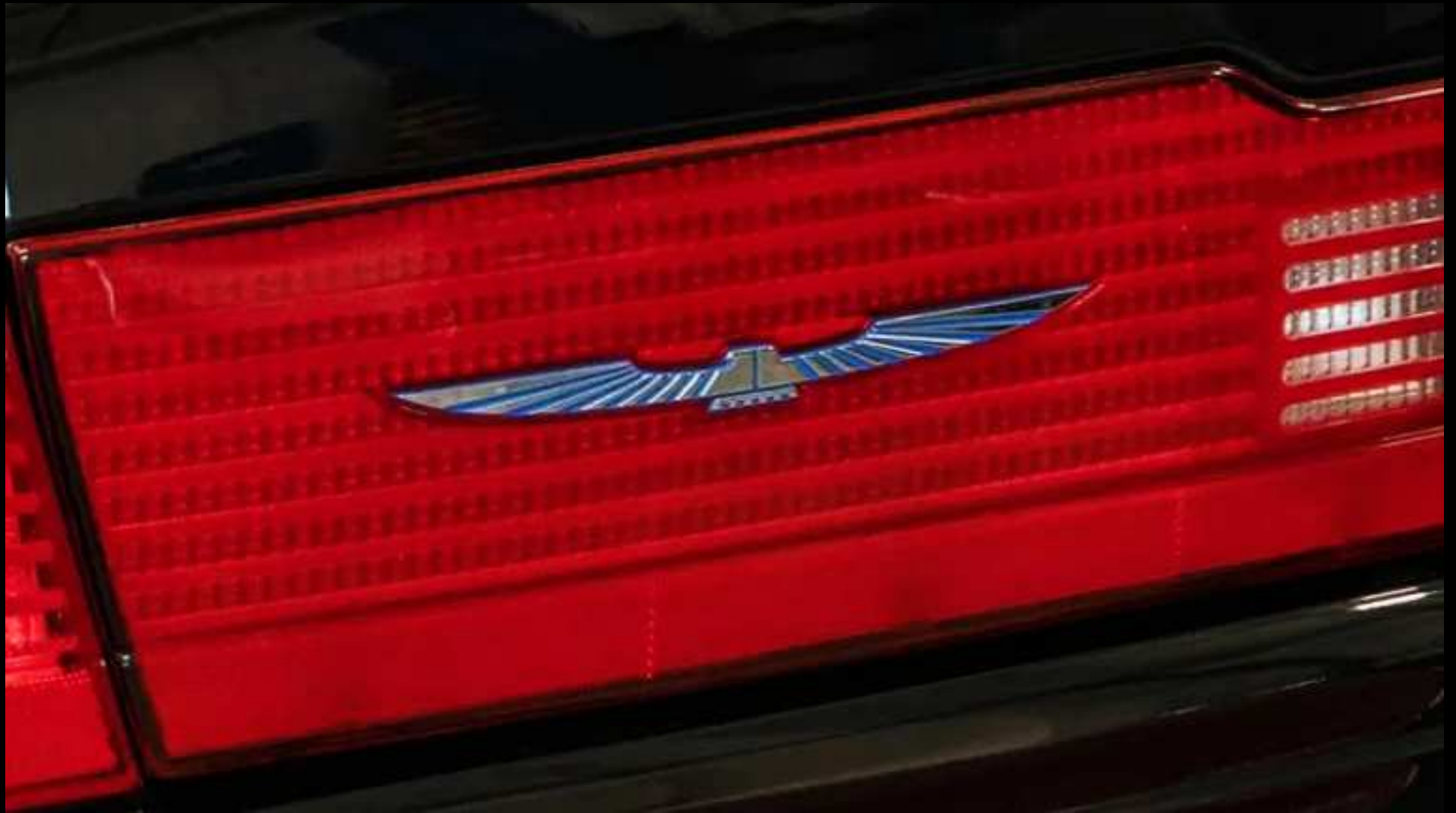
Blue Fill in the Taillight Medallion Feathers