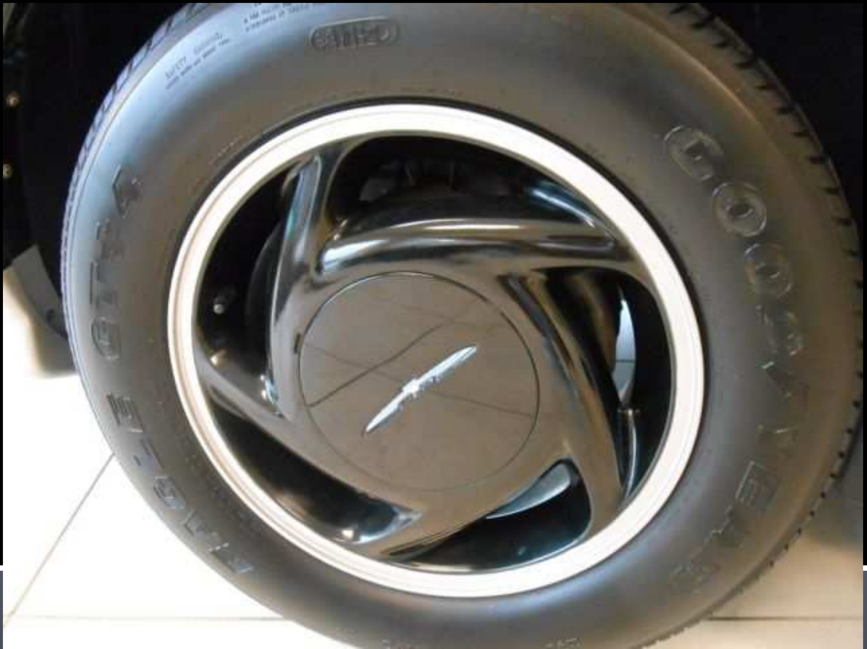
Unique Black Alloy Wheels