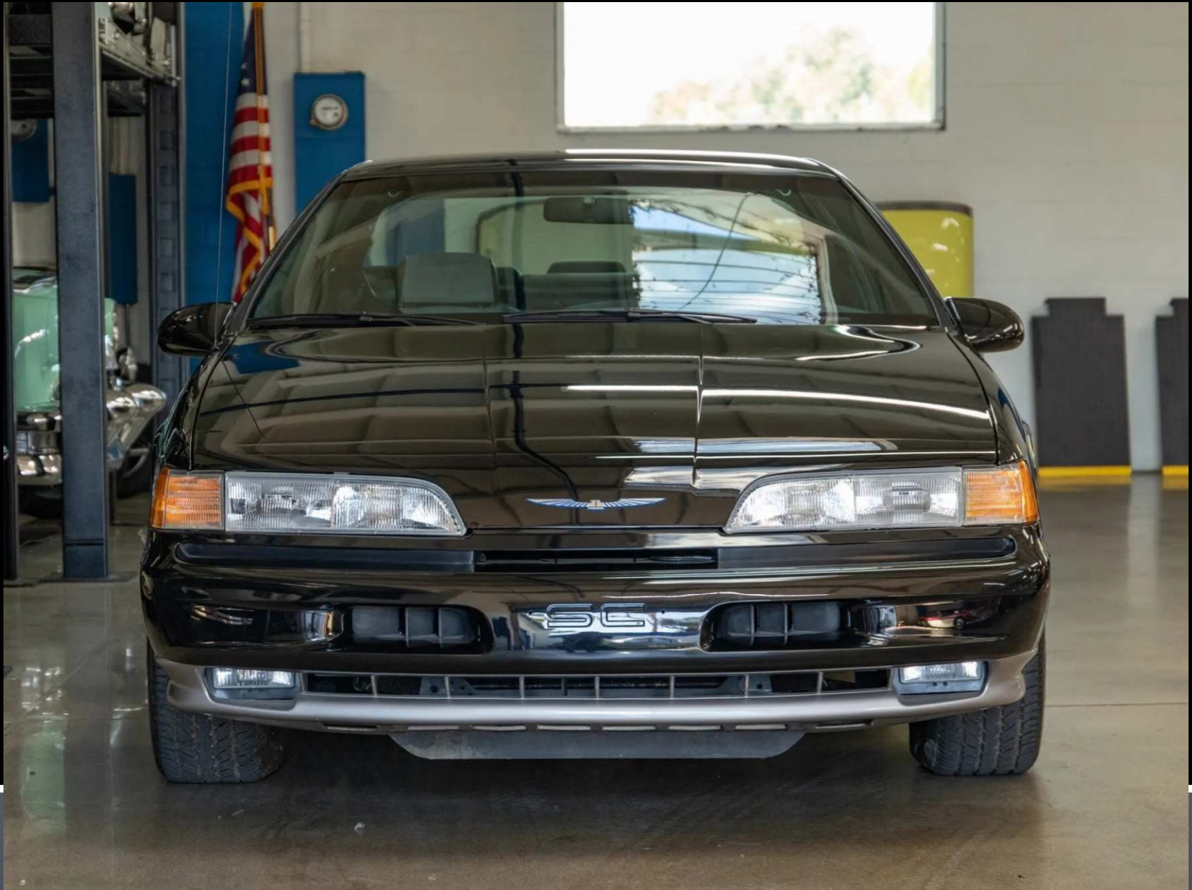
From the Front