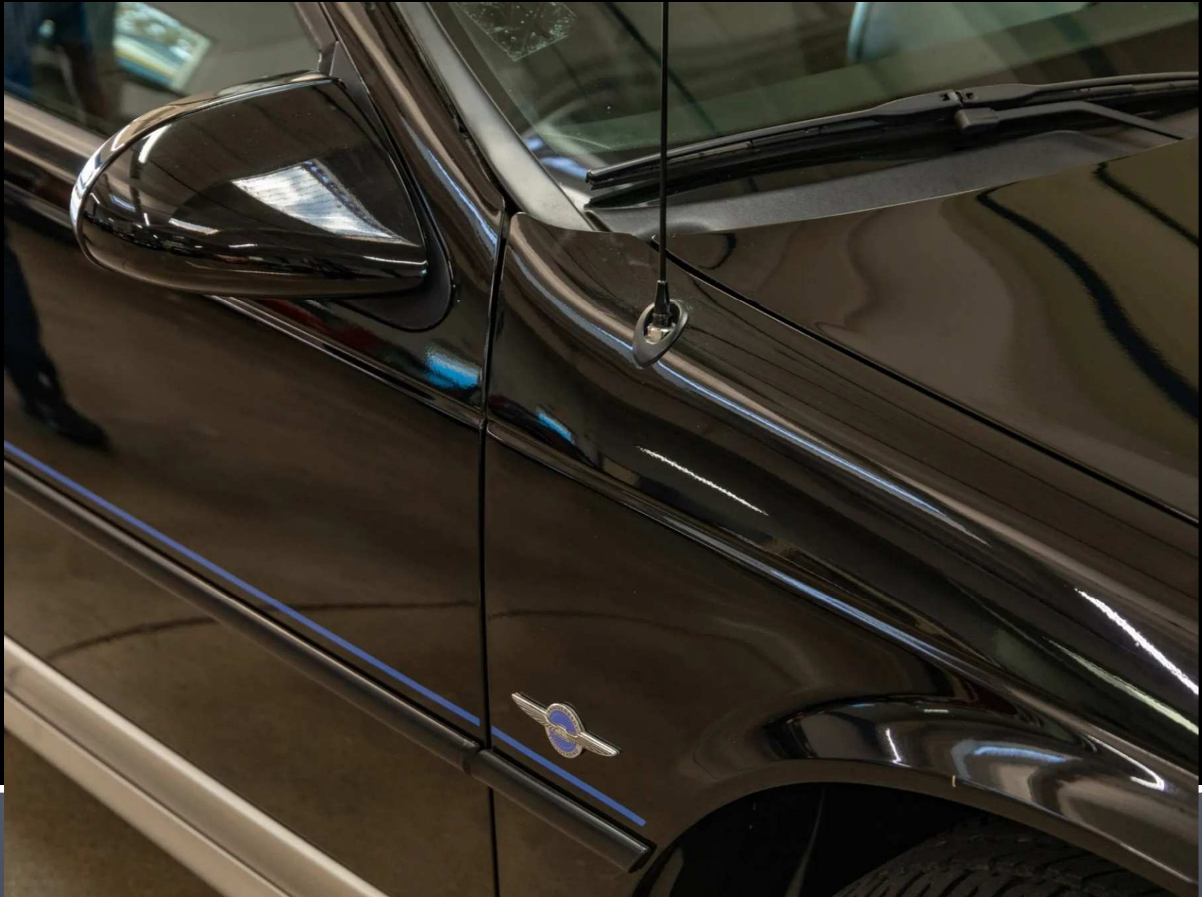
The Blue Side Stripe and Special Badging