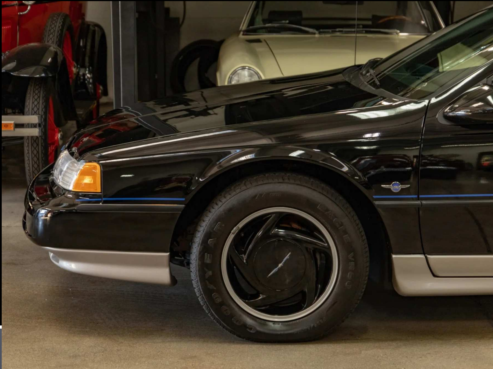
The Blue Side Stripe and Special Badging