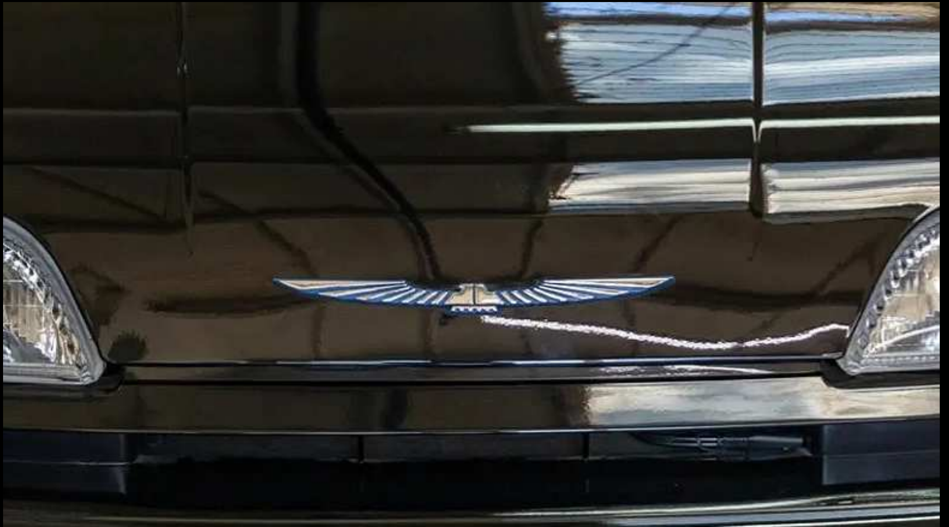
Blue Fill in the Hood Medallion Feathers