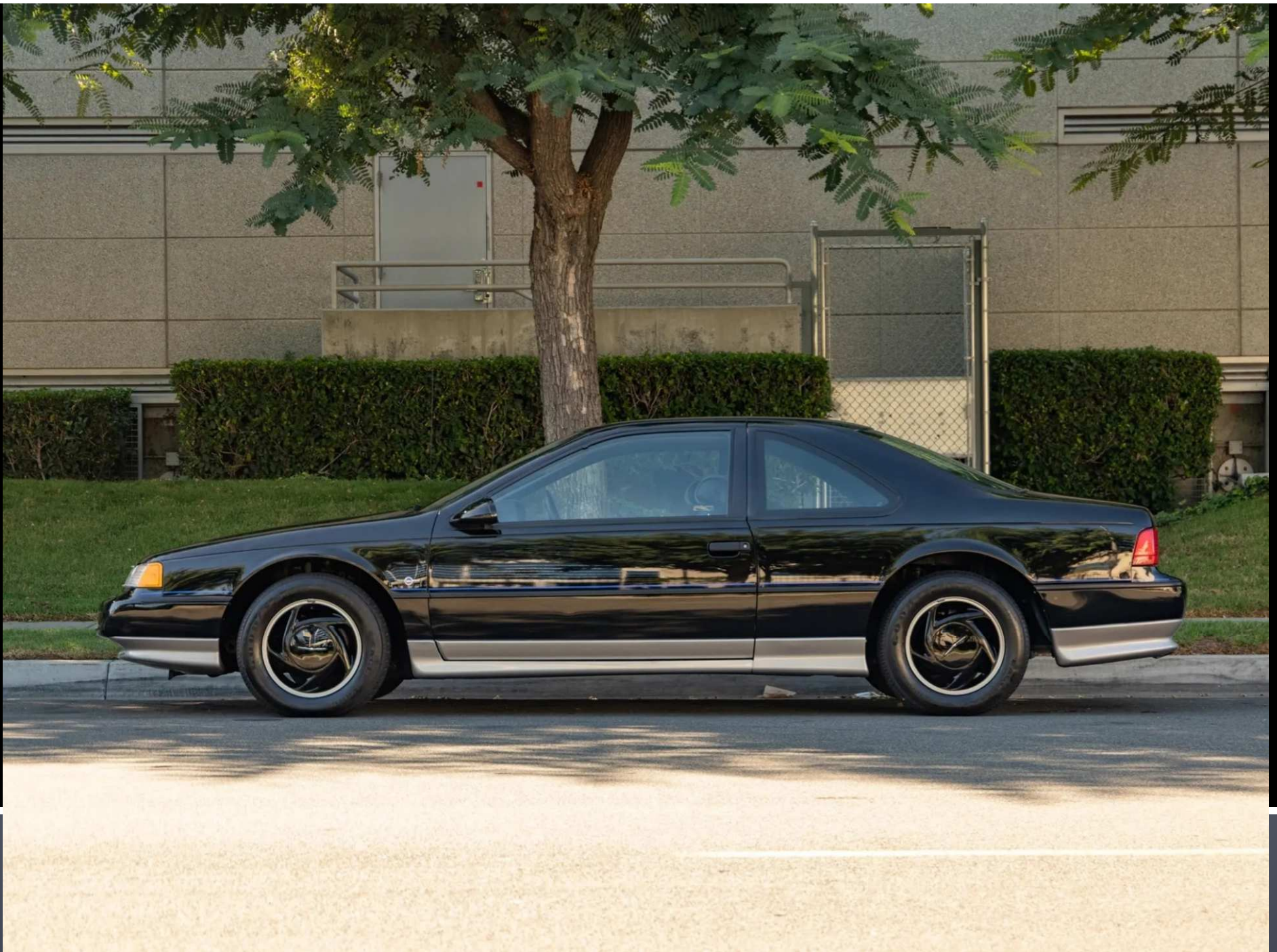
The 1990 35 th Anniversary Special Edition Thunderbird Super Coupe