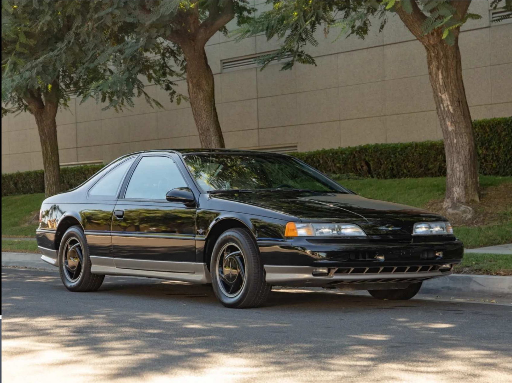
The 1990 35 th Anniversary Special Edition Thunderbird Super Coupe