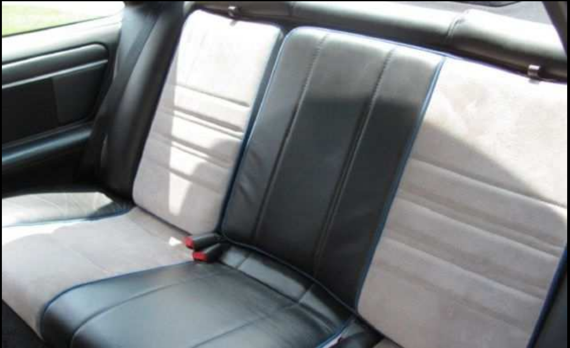
Matching Black and White Rear Seats